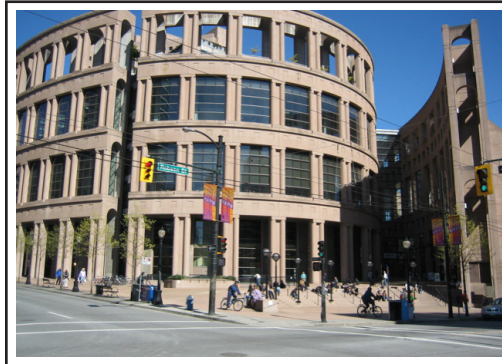
VANCOUVER PUBLIC LIBRARY